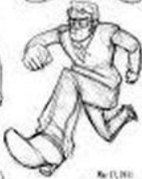
Mr. (L, D, G) President of IS-300-M